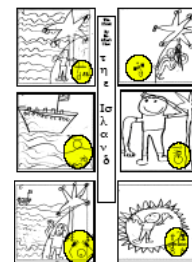
Deaf Children Write Stories Albuquerque, New Mexico