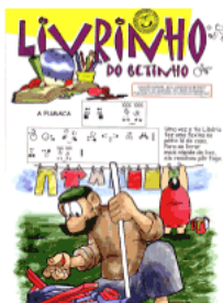
Brazilian Sign Language Newsletters in Brazil

Read these documents on the web. Go to: www.SignWriting.org/archive