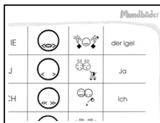
Das Gebaerdenbuch Hamburg, Germany